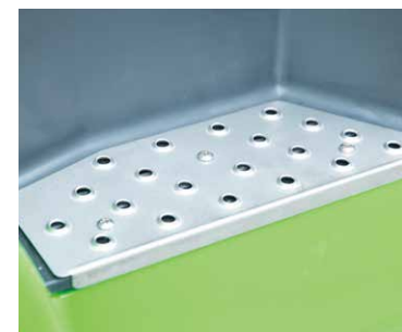
Low and Wide Step