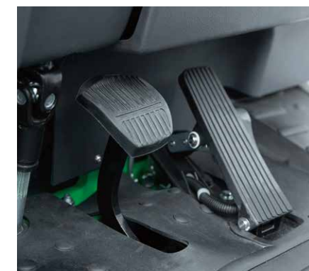
Pedals with comfortable angle