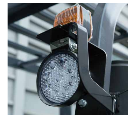
Led lights: energy saving, long life