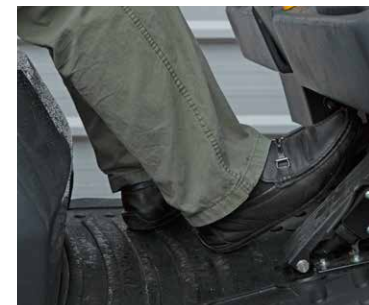
Large foot space

Owing to the low center of gravity and good stability, the driver feels comfortable during turning. Bigger leg space than standard Li-ion forklifts.