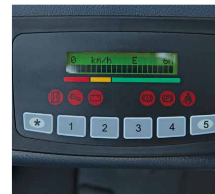
Zapi controller with multifunctional instrument panel